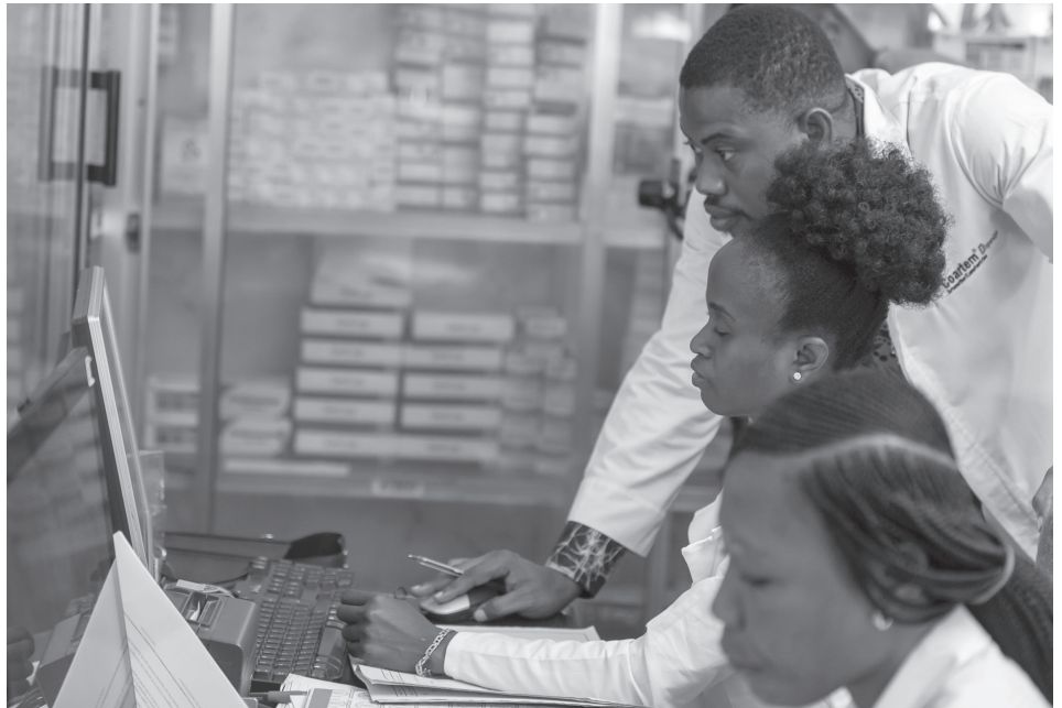
Pharmacists entering consumption data.

Next, to understand NDSO's true costs, GHSC-PSM applied ABC performance and accountability tools at the financial, distribution center, transportation and