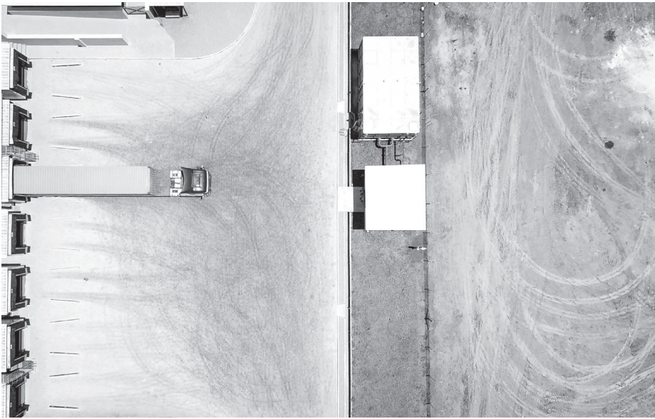
Activity-based costing gives managers a new perspective on how best to utilize human and financial resources.

for donor-funded products and essential medicines are segregated and quantified.