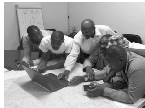
National Drug Service Organization (NDSO) staff in Lesotho conduct daily planning of distribution center activities as part of ABC implementation.

Once staff understood the intention and benefits of ABC implementation and bought into the change, they became more engaged in the process changes, worked together as a team and had direct input into the evolving processes. This made staff feel empowered and improved morale.