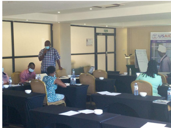
Health Products and Technologies Unit sensitization cluster meeting in Machakos for Nairobi, Kiambu, Kajiado, Kitui and Makueni counties.