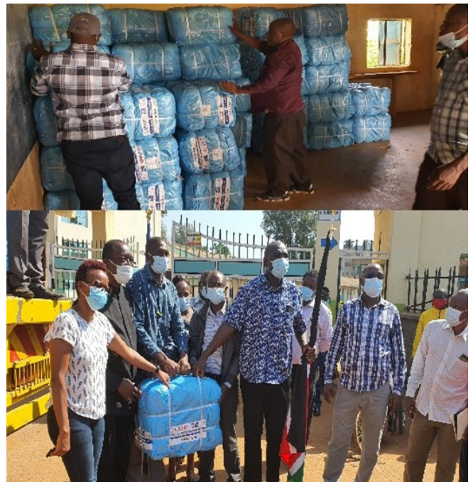
Deputy Governor Busia county, USAID/Afya Ugavi and KEMSA/ MCP staff during delivery of the PBO ITNs to the drop off stores.

Distribution of these PBO ITNs will ensure mosquitoes are locked down during this COVID-19 pandemic while ensuring that about 1.1 million people in Busia are protected from Malaria.