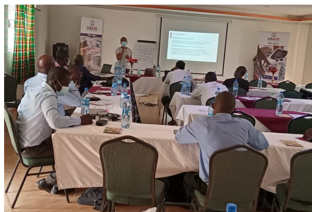
Health Products and Technologies Unit sensitization cluster meeting in Nyeri for Murang'a, Kirinyaga, Embu, Isiolo, Laikipia, Marsabit counties.