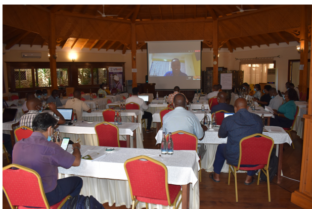
Health Products and Technologies Unit sensitization cluster meeting in Malindi for Mombasa, Kilifi, Lamu, Kwale, Tana River, and Taita Taveta counties.