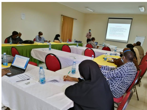
Health Products and Technologies Unit sensitization cluster meeting in Embu for Wajir, Garissa, Mandera, Nyeri, Meru, Tharaka Nithi counties.